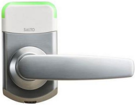
XS4 Mini ANSI

A wide range of SALTO products can be deployed easily with the Gallagher solution, a selection of supported products are displayed below. For more detail on SALTO products, please contact your nearest Gallagher representative.