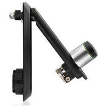
Server Cabinet Cylinder