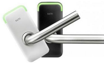
XS4 Mini EURO