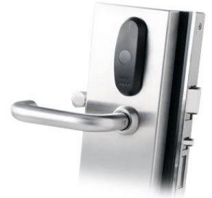
Glass Door Escutcheon