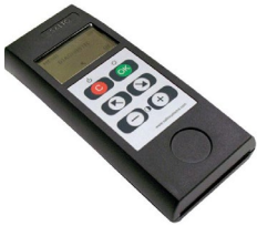
Portable Programming Device