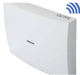
BLE Wireless Gateway