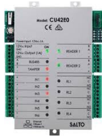
CU42 Control Unit